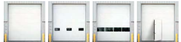
MODEL U100 closed door